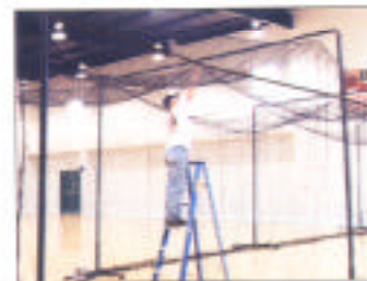
8. Attach to crossbar centers.