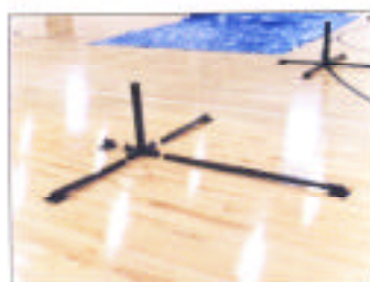
1. Attach legs to base post.