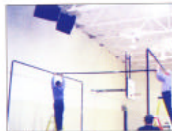
5. Attach center support bars. (Use 3/8" socket to tighten.)