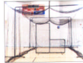
9. Add optional L-Screen.