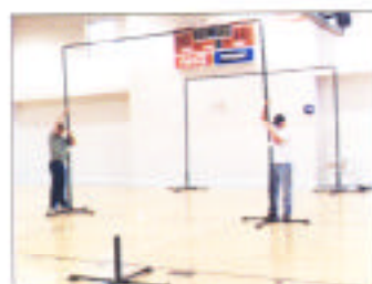
4. Insert crossbar section.