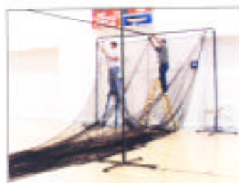
7. Attach net to crossbars.