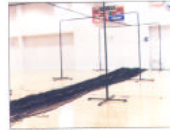
6. Stretch out net.