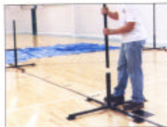
2. Insert vertical poles.