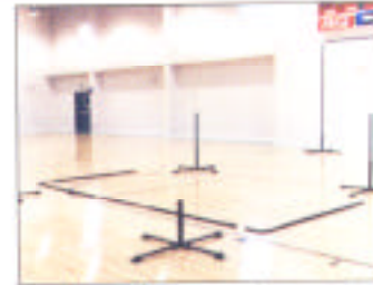
3. Assemble crossbar section.